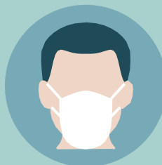
Wearing a mask