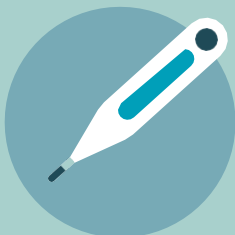
Monitoring the staff's health